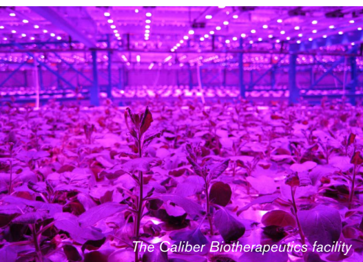
The Caliber Biotherapeutics facility

DeltaDOT is a member of the Texas A&M System Proposal Team, awarded a