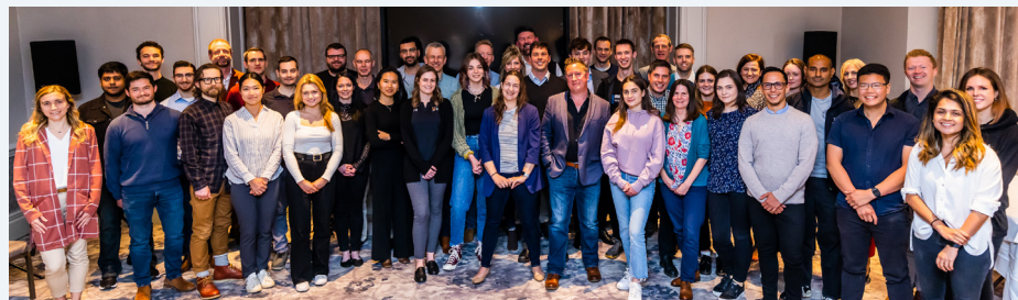
Ori team April 2022