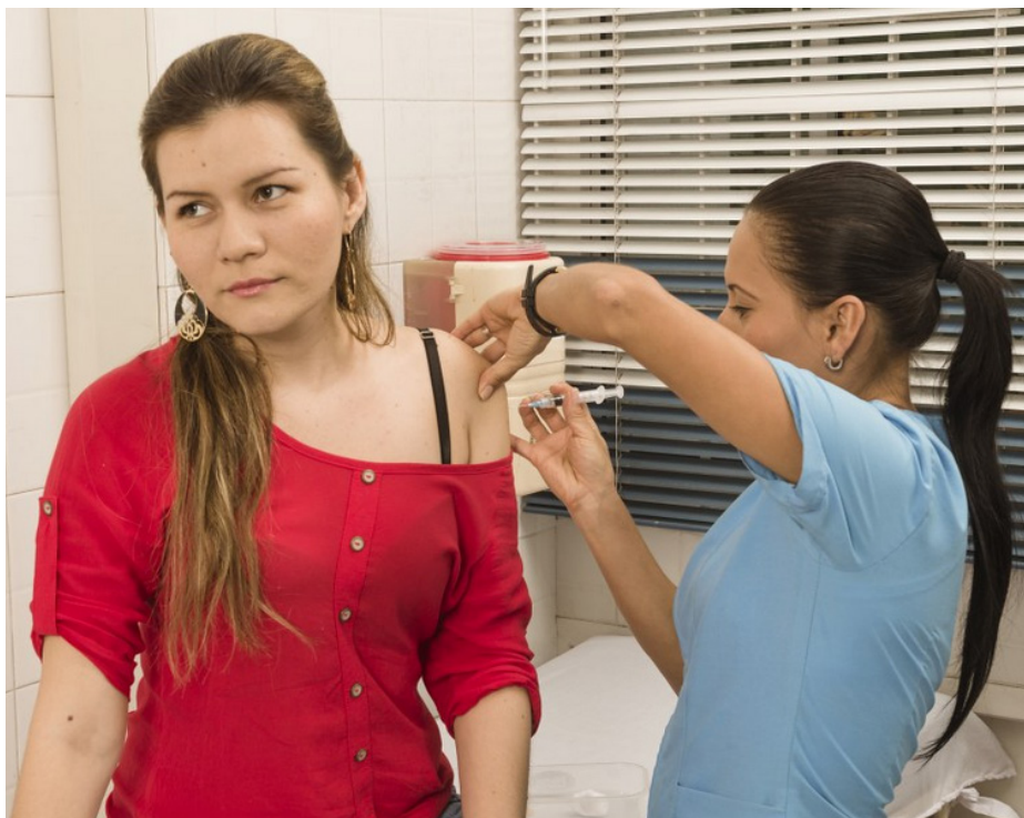
Dengue Clinical trials by Sanofi Pasteur