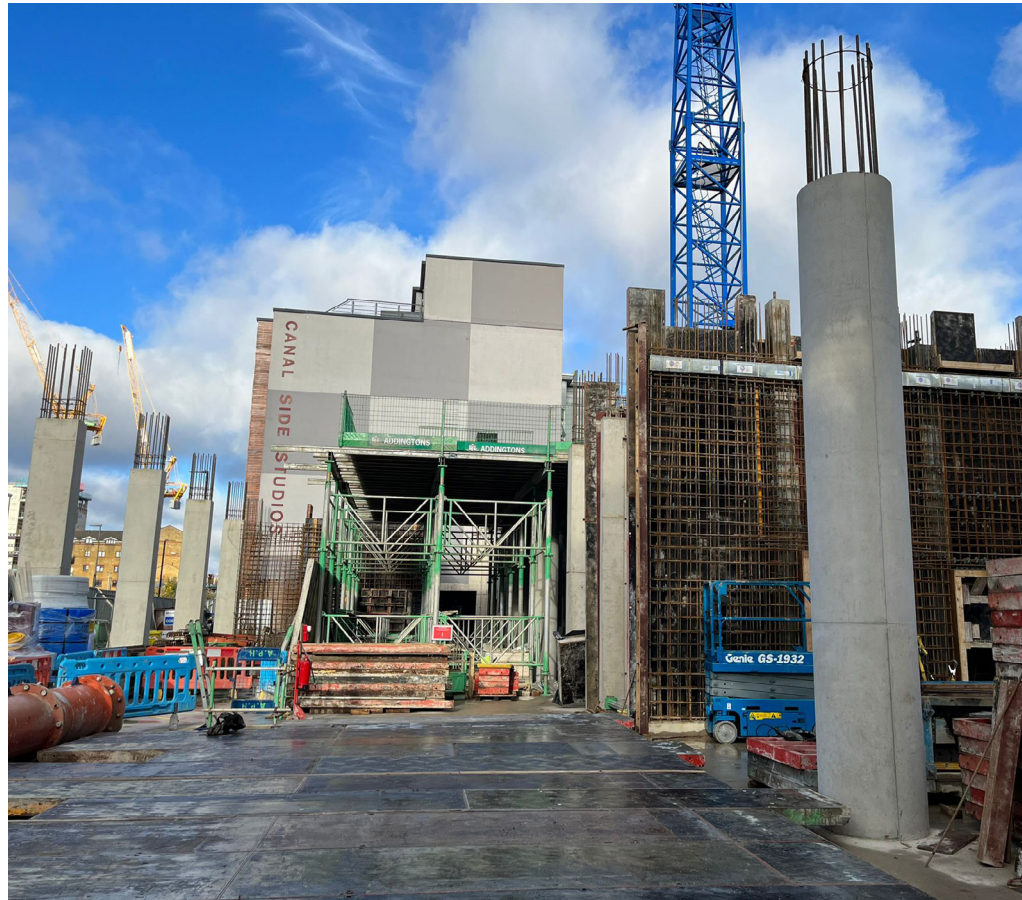
Construction underway at LBIC's state-of-the-art Apex facility

able to support the next stage of the growth and development of LBIC. We look forward to the enhanced impact that this expansion will deliver through additional research collaborations and industry links."