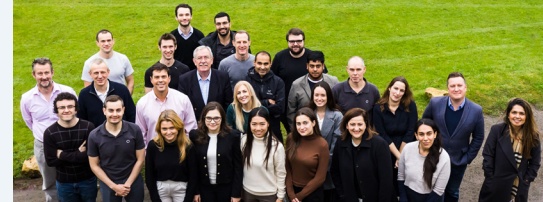
Ori team Jan 2022

Our people are what makes Ori special – they drive our goals, our innovations, and our decision-making process. First and foremost, our team is aligned behind our