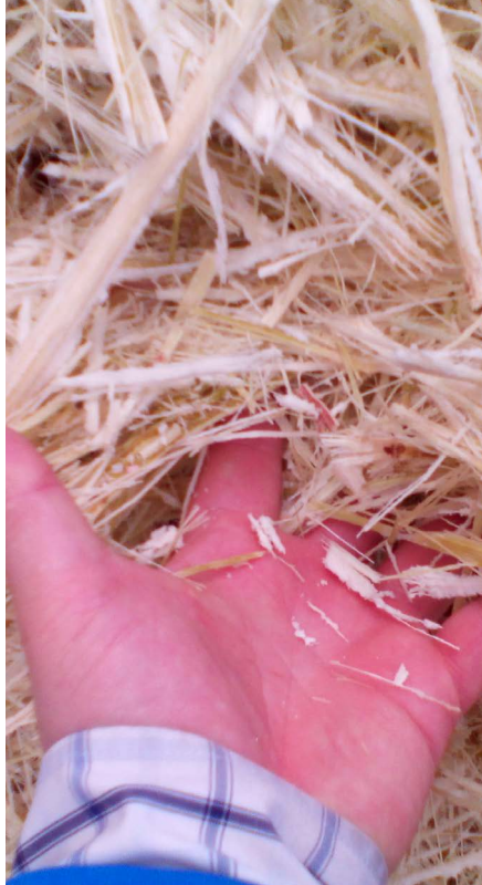
Alkol's sugarcane bagasse