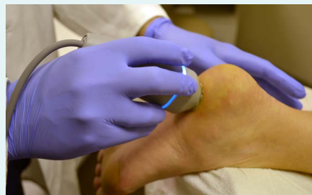
Heel treatment using Actisound Intense Therapeutic Ultrasound

Actisound's Intense Therapeutic Ultrasound (ITU) acts like an invisible scalpel – working beneath the surface of the skin – precisely delivering small thermal ablations to tendons, ligaments and other soft tissue to stimulate collagen growth and the regeneration of connective tissue. Unlike other energy sources such as laser, microwave and radio frequency, ultrasound