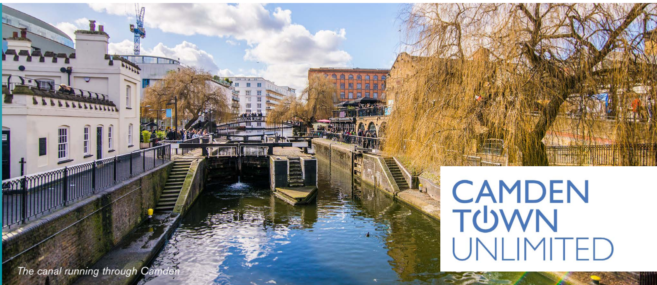
The canal running through Camden

appealing to walk under but also avoids disturbing local wildlife; reed beds and planting schemes that bring the natural world to life; and towpath improvements and widening where possible to allow better access for pedestrians and cyclists.