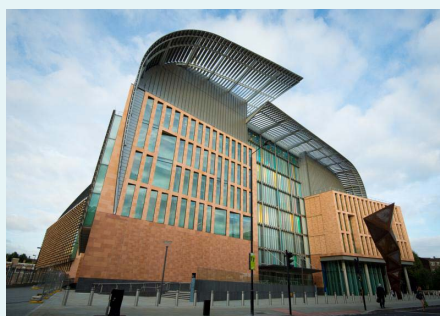
The Francis Crick Institute, Kings Cross

Providing critical support to early-stage