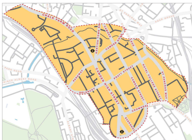
Map showing the area covered by CTU's initiatives

Regular walking tours are run by the group that discuss the history, design and funding of the project. Visitors are able to