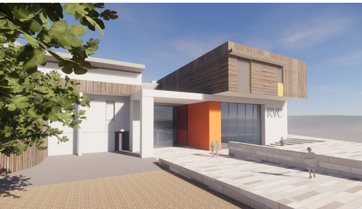
Artist's impression of the entrance to the Hub

The Hertfordshire Local Enterprise Partnership (LEP) has recently awarded LBIC's parent company, the Royal Veterinary College (RVC), a £7 million grant from the Single Local Growth Fund to support the creation of a state-of-the-art Veterinary Vaccinology and Cell Therapy Hub on its Hawkshead campus.