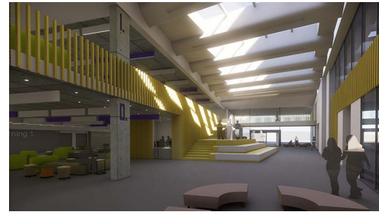
The modern interior envisaged for the new Hub