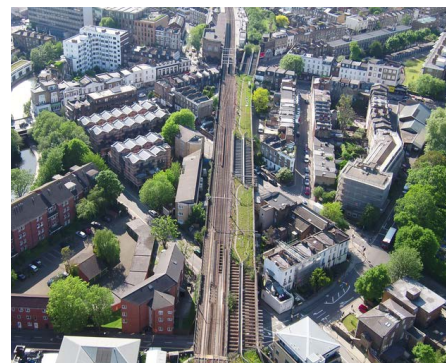
An aerial view of the Camden Highline

With these initiatives and various other ongoing projects, the group will continue to work to improve and enhance the area for local businesses and residents. You can find out more about what CTU is working on and the various events they hold throughout the year by visiting www.camdentownunlimited.com