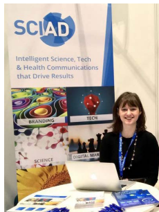
Manning the Sciad exhibition stand

Managing Partner and co-founder of Sciad