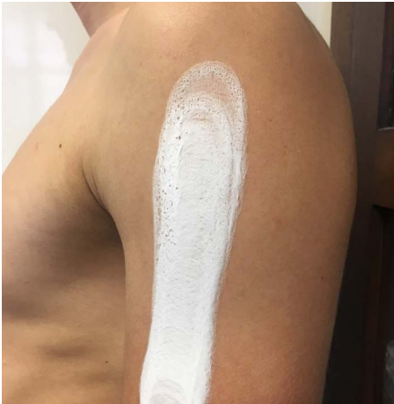
Fabrican's new topical medical skin patch

LBIC welcomes these new clients to the Centre: