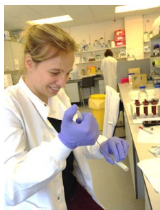
A student learning lab techniques

“We have had two placement students – one for a year and the other for three months.